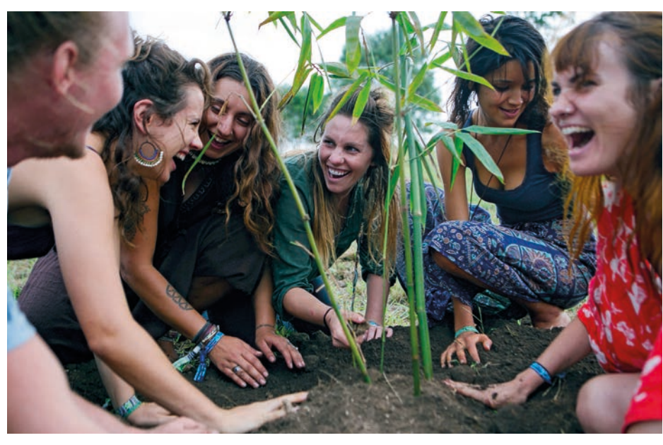
Volunteers plant bamboo at Woodford Folk Festival's yearly planting event on the festival's property in Queensland. The bamboo will later be harvested for festival construction.

"Since there is such a plethora of events to