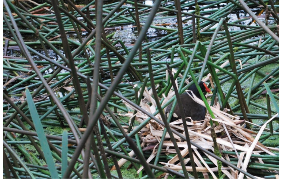
A dusky moorhen nesting on the small lake, just one of the many waterbirds that use this natural feature. The lake is fed from water from the roof, and has not been dry since establishment in 1989.

We were very lucky timing-wise. The early 1990s was a period of good rainfall and hence the plants, particularly the trees, established