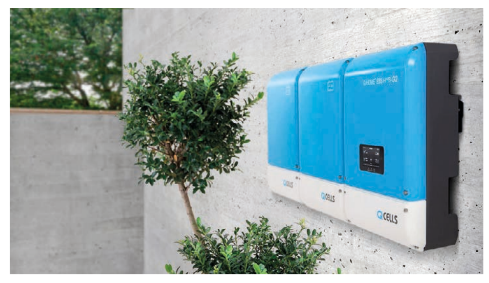
Hanwha Q Cells are launching into energy storage with the Q.Home offering, which includes solar panels, battery and inverter in one package. The battery uses Samsung SDI cells and the inverter is from Hanwha Q Cells.

Solar Quotes also reports warranted kWh cost, which helps when comparing the price of using a battery compared to getting that same energy from the grid. Warranted kWh uses the length of the warranty provided and assumes either one or two full cycles per day to calculate the cost of using the battery over that warranted life. Most of the batteries mentioned have cost per warranted kWh for one full cycle per day ranging from 22c for the BYD B-Box through to more typical prices around 30c (LG Chem Resu 10 and Tesla Powerwall 2) to 40c (Sonnen), 48c (Enphase AC batteries) and right up to 70c to 90c for some systems. It's clear we have a way to go before battery prices are competitive with using that same energy from the grid, especially as a fair comparison would add at least an extra 10 c/kWh to the cost of energy from the battery to allow for efficiency losses and the forgone feed-in tariff.