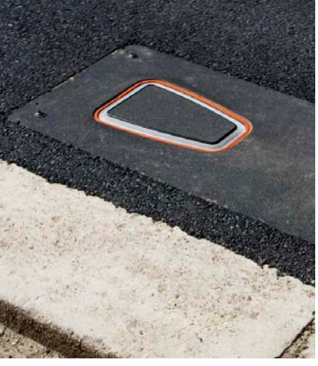
Urban Electric's pop-up EVSE pillar allows for AC charging on the street, and then can 'disappear' under the surface when not in use.