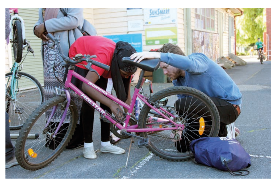
Bikes being fixed at Flemington Primary's Bicycle Hospital.

But they put the call out anyway. "We started out under the peppercorn tree