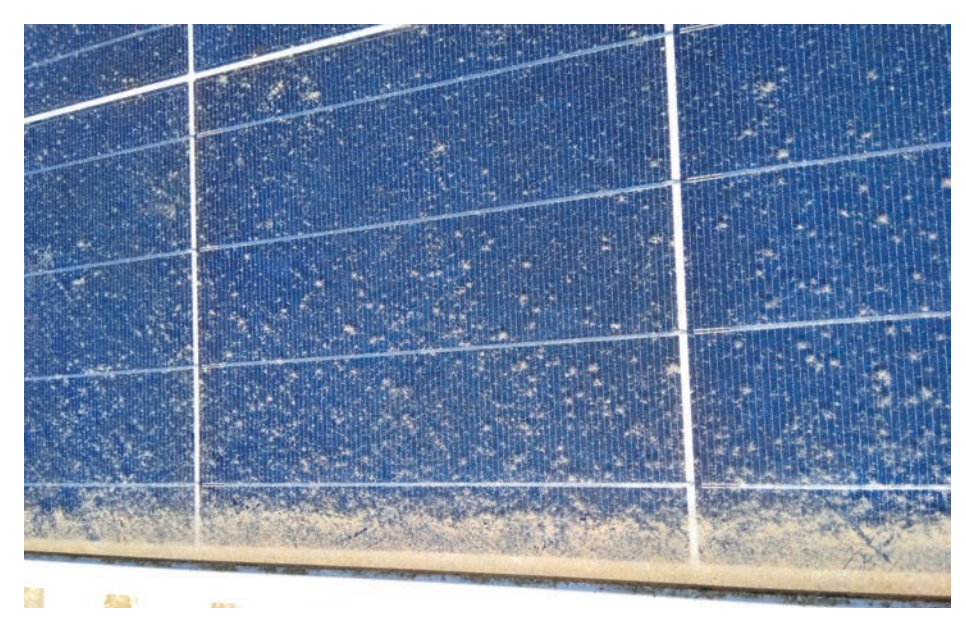
Dust can build up on solar panels to the point where power output can be noticeably affected. These panels, in a rural area, hadn't been cleaned in almost five years, with energy output down around 6%.