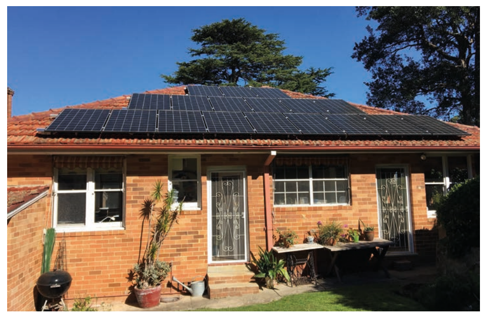
The view from the backyard is quite impressive, as the north-east array has filled almost all available roof space.

Being a keen reader of Renew and Sanctuary magazines and having attended a number of energy expos, I was aware of the rapidly falling cost of solar panels. So, in early 2019,