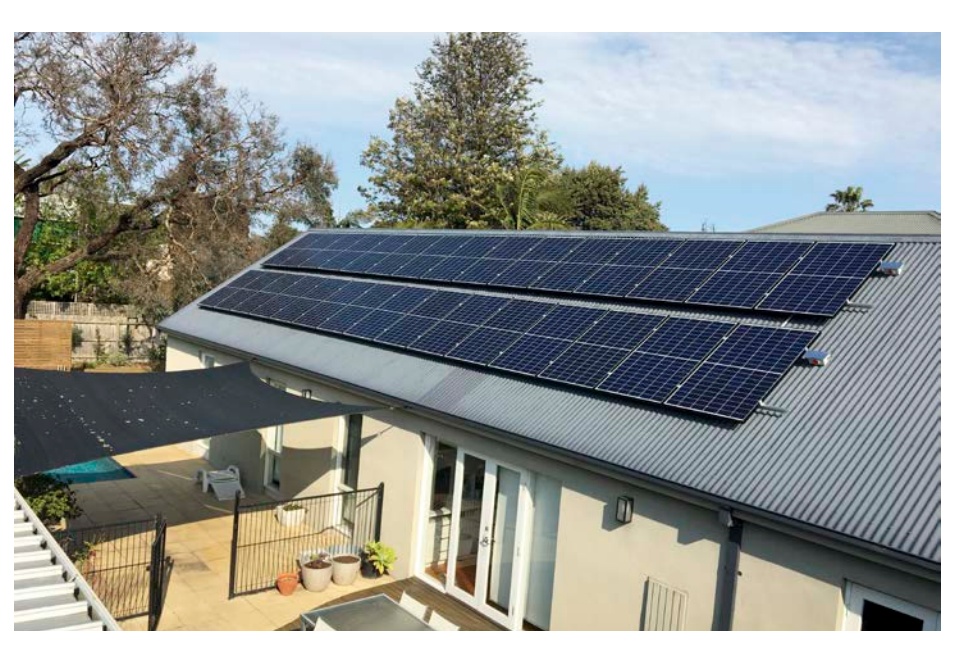
Solar\ systems\ now\ tend\ towards\ larger\ sizes,\ with\ the\ average\ size\ being\ around\ 7kW\ and\ many\ closer\ to\ 10kW.

The payback period will depend on location (how sunny it is where you live), energy retail tariffs (what you pay for electricity), feed-in tariff rates (what you receive for exported solar electricity), household electricity consumption patterns (how much electricity you use, and when), system costs, which can vary depending on